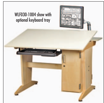
WLF030-1004 show with optional keyboard tray

Features include solid maple pedestal style panel legs and one solid maple truss, 9"D rear shelf, security cabinet (tower or desktop model), leveling foot glides, and keys. Finished with earth-friendly, water-based finish, the table also includes a fully adjustable 3/4" plastic laminate top with 1.5m PVC edging. Overall size: 42"W x 39"D x 30"H (at front). Assembly required. Freight class 100.